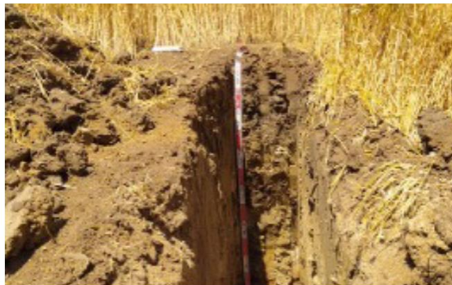
Example test pit site