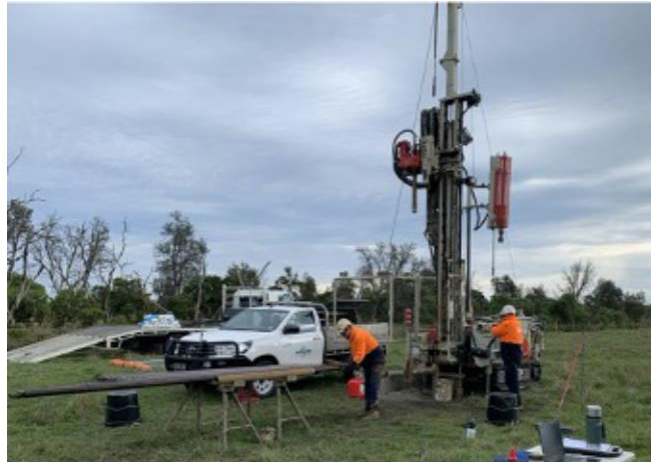
Example drill rig