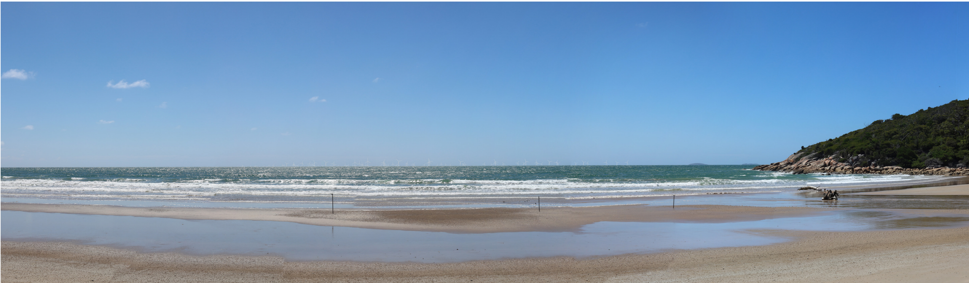
Figure 171 View location 23: Photomontage view – 350-metre tip height parameter