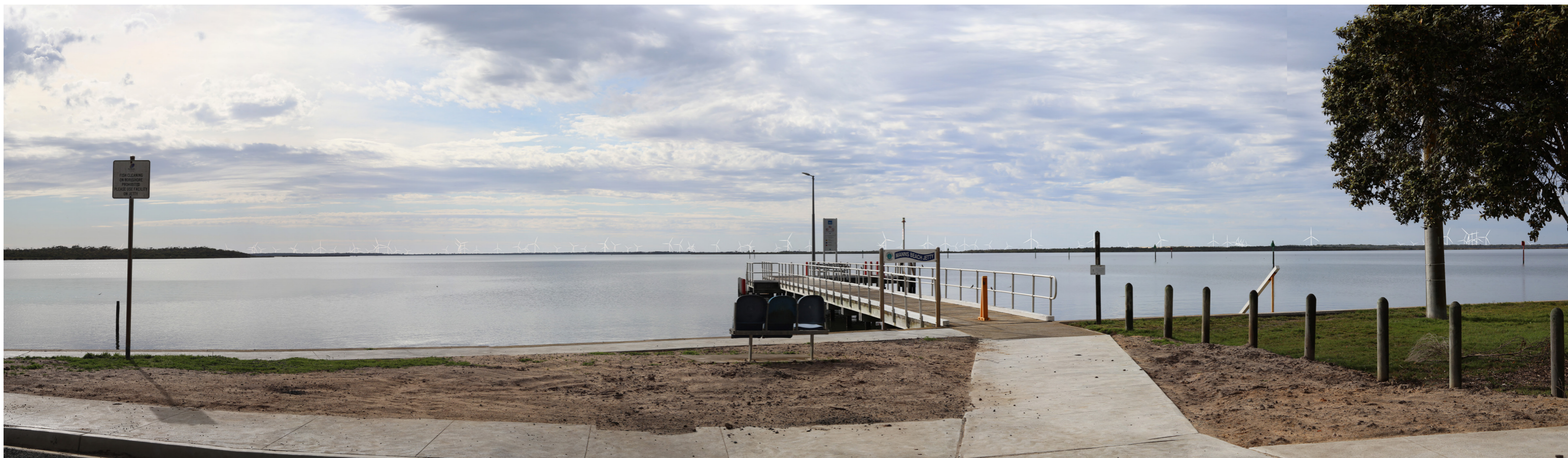
Figure 101 View location 09: Photomontage view – 350-metre tip height parameter