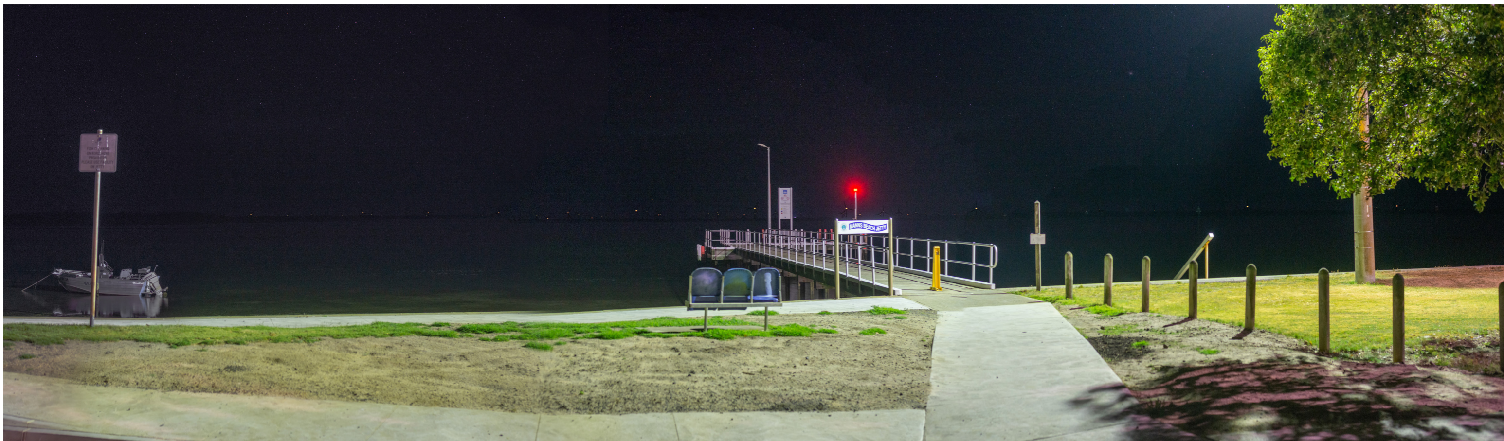
Figure 229 View location 09 (night time): Photomontage view – 350-metre tip height parameter