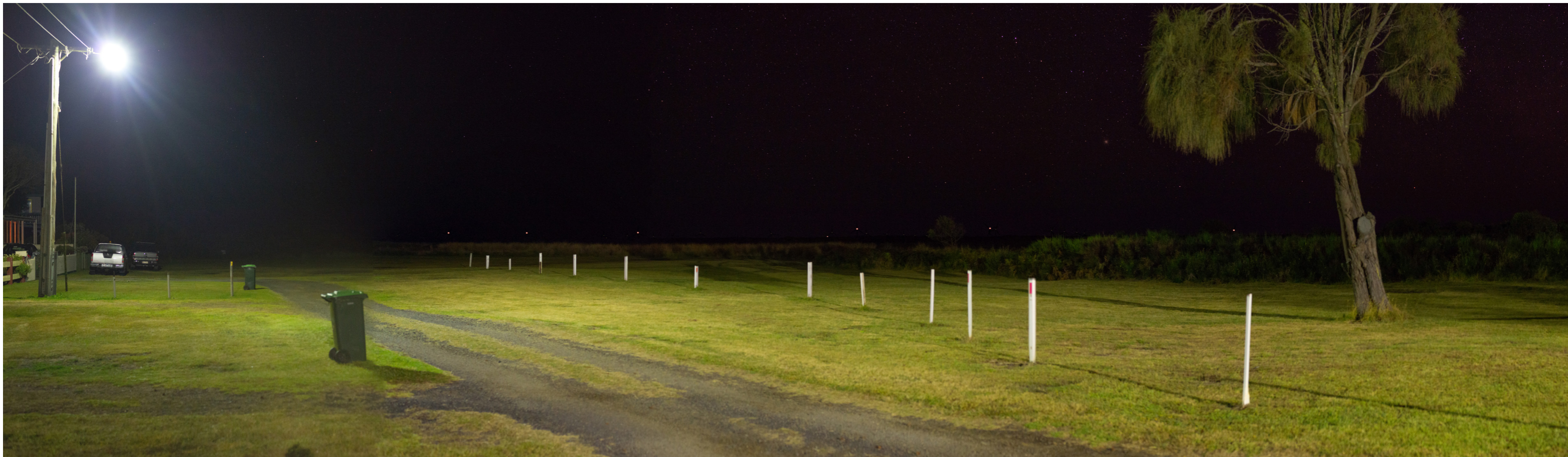
Figure 219 View location 07 (night time): Photomontage view – 350-metre tip height parameter