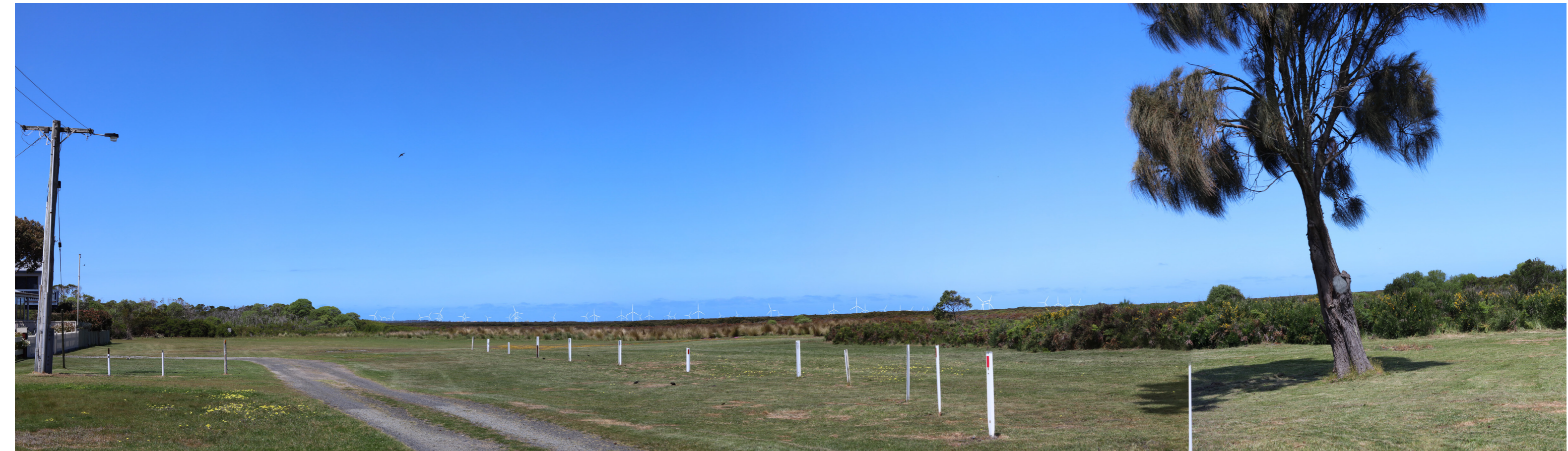
Figure 91 View location 07: Photomontage view – 350-metre tip height parameter