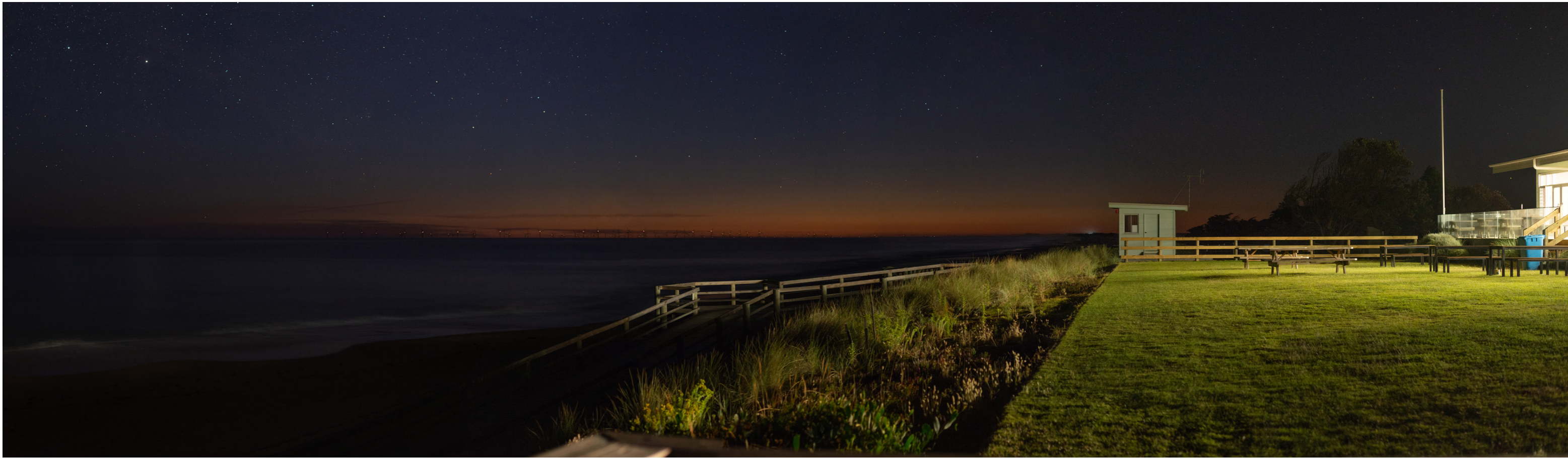
Figure 269 View location 19 (night time): Photomontage view – 350-metre tip height parameter