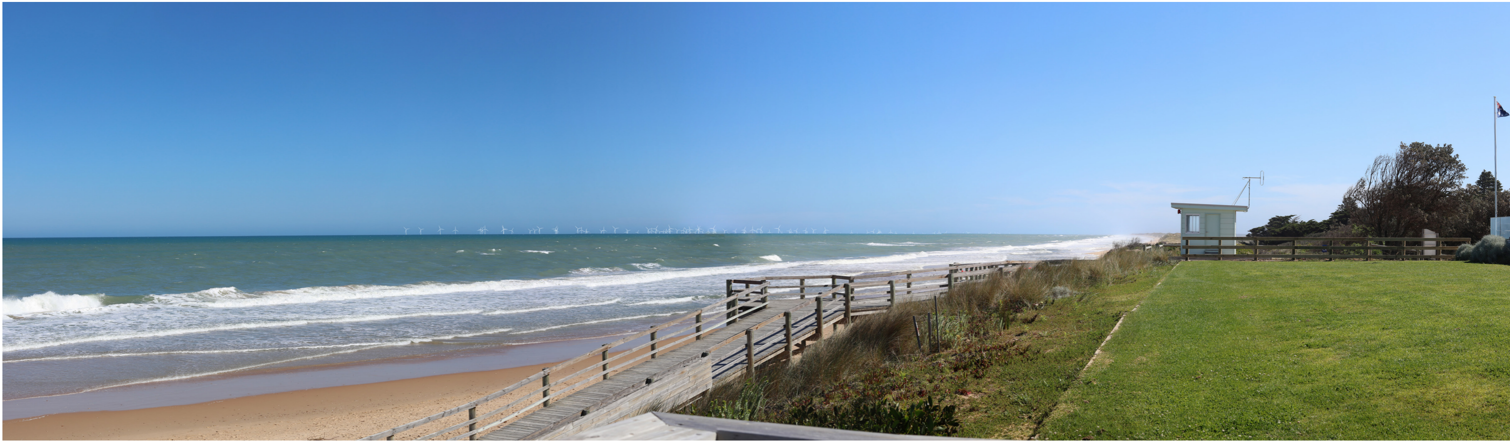
Figure 151 View location 19: Photomontage view – 350-metre tip height parameter