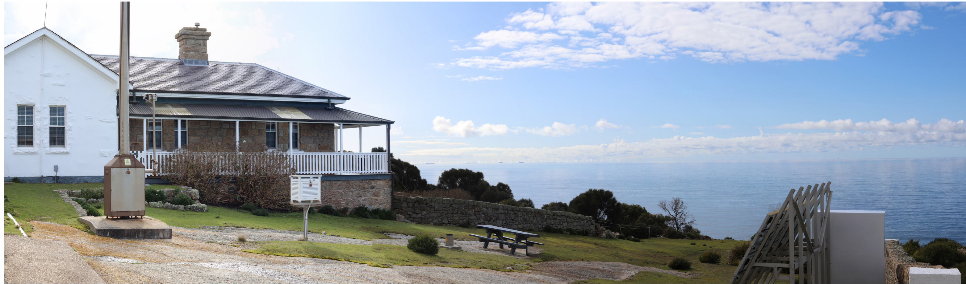
Figure 191 View location 27: Photomontage view – 350-metre tip height parameter