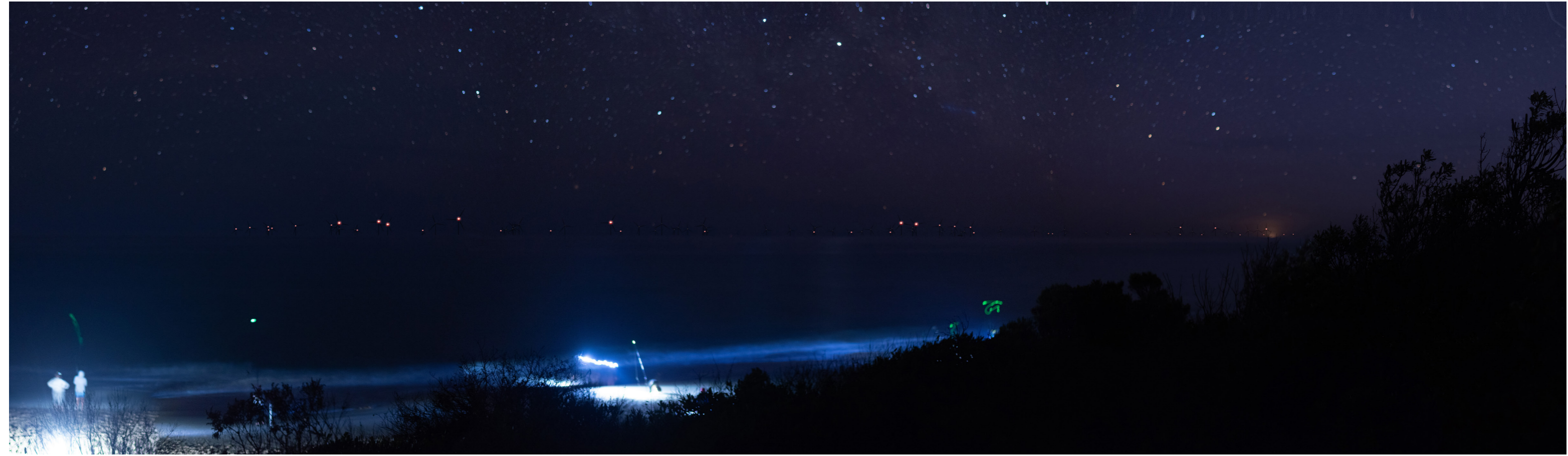
Figure 244 View location 13 (night time): Photomontage view – 350-metre tip height parameter