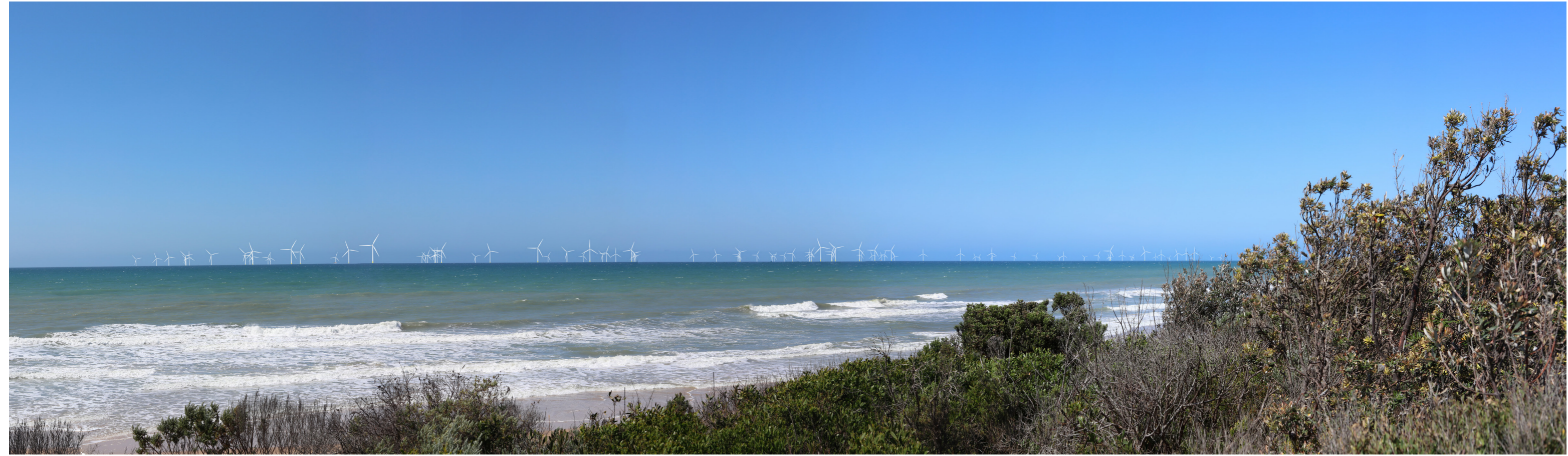
Figure 121 View location 13: Photomontage view – 350-metre tip height parameter