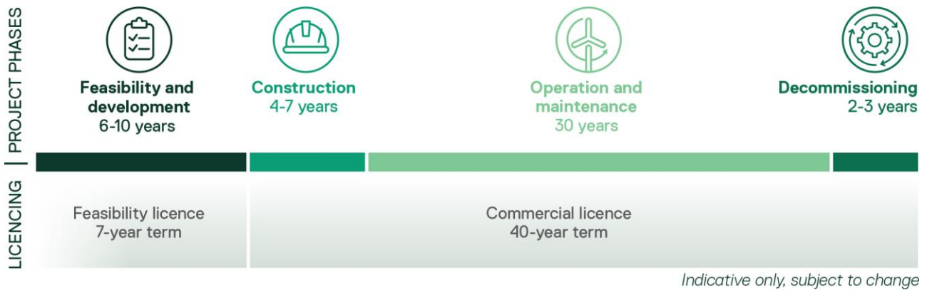
Figure 1-3 Offshore wind project timeline